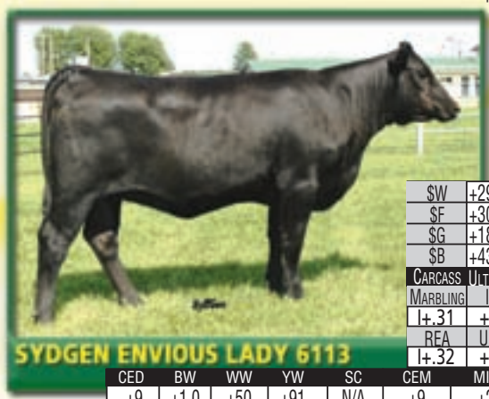
SYDGEN ENVIOUS LADY 6113

We also expect more than 300 head of commercial bred heifers for our 10th Annual SydGen Influence Sale, to be held the night of November 17th.