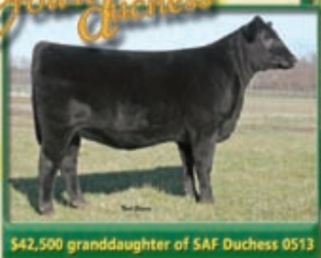
$42,500 granddaughter of SAF Duchess 0513