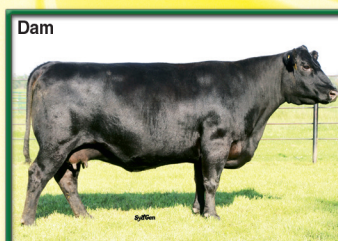
SydGen ForeverLady 1255

Ranks in the top 5% for Scrotal EPD. Has consistently made high volumes of high-quality semen. 14 sons have averaged 102 ratio for scrotal circumference. Ranks in the top 15% for Heifer Pregnancy EPD.