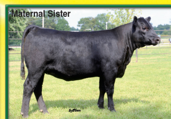
SydGen Forever Lady 6093