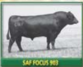
SAF FOCUS 903