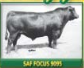
SAF FOCUS 9095