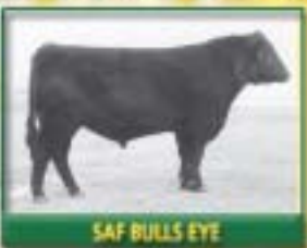
SAF BULLS EYE