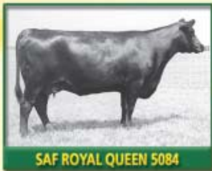
SAF ROYAL QUEEN 5084

Owned with Paws Up Angus Ranch, Greenough, MT, and Van Nice Angus Ranch, Silver Star, MT