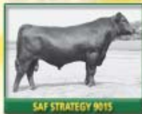
SAF STRATEGY 9015